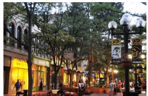
Pearl Street Mall

Boulderado rooms have Victorian-style decor and include free WiFi, iPod docking stations, desks and flat-screen TVs. Room service is available. On-site establishments include a steak and seafood restaurant (Spruce Farm and Fish), a casual restaurant/bar with