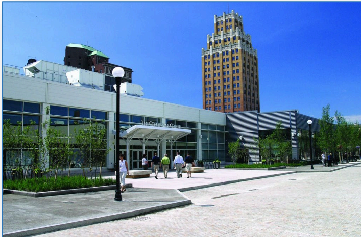
Conference and Event Center Niagara Falls, where the technical sessions, business lunch and awards dinner will take place.

For those not staying at the Sheraton at the Falls, and who may require parking facilities during the day while attending the meeting, there is plenty of parking in the area. Most city parking lots and ramps are $20 per day; street parking is $3 per hour; and parking at Niagara Falls State Park is $10 per day. More information and parking maps can be found on the Conference Center and Destination Niagara USA websites.