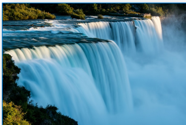
The American Falls, viewed from just south of the Niagara Falls Observation Tower in Niagara Falls State Park.

Any further updates will be distributed to AESE members via email and also posted on AESE's website ( www.aese.org ). Be sure to check the website regularly if, for some reason, you are not receiving communication otherwise.